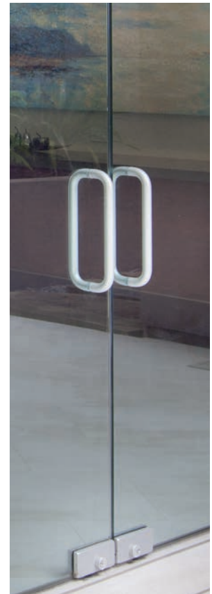
Economy series handles