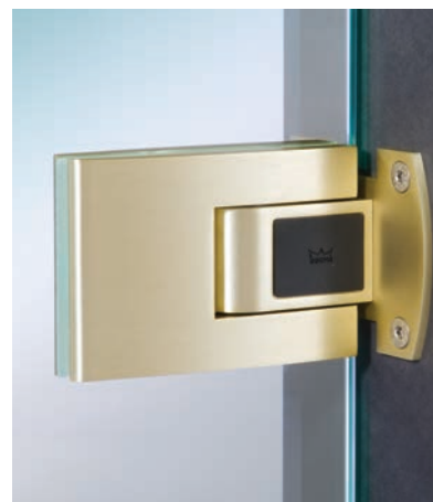
TENSOR double-acting hinge