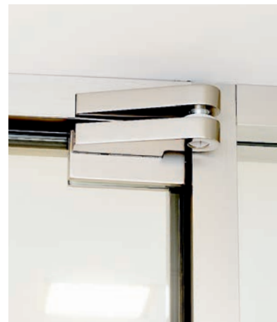
EA offset fittings