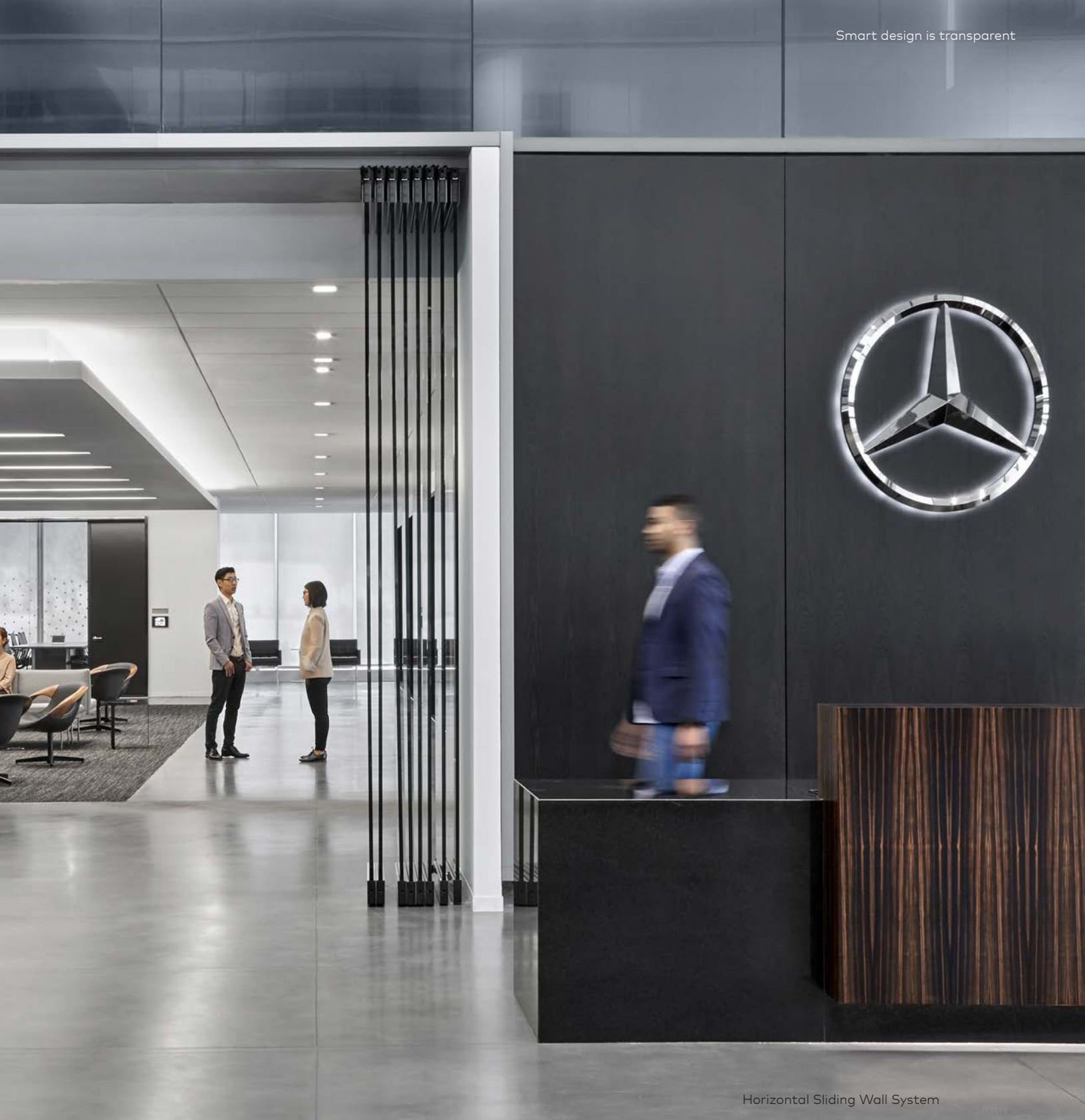
Horizontal Sliding Wall System

Smart design is healthy. You can trust dormakaba glass systems for contemporary design solutions that give clarity to space design.