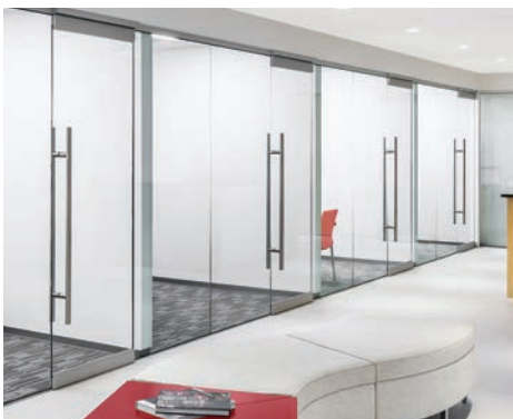
TG 9387 handles