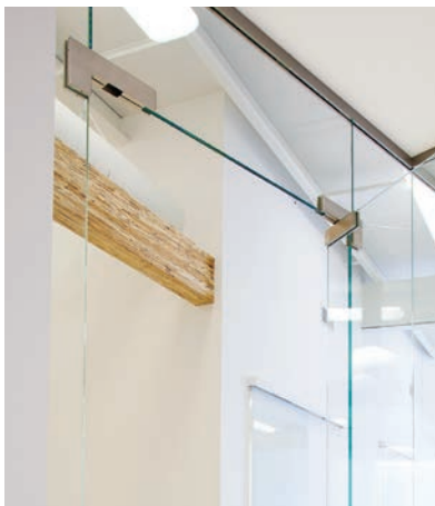
Universal patch fittings

With its broad range of options and configurations, Universal patch fittings are ideal for almost any design. Tempered glass assemblies are provided with fixed parts in a variety of arrangements—with corner fittings or fin fittings for double- or single-acting doors in single- or double-door designs. Universal fittings are supplied standard with gaskets to suit 3/8" (10) and 1/2" (12) glass.