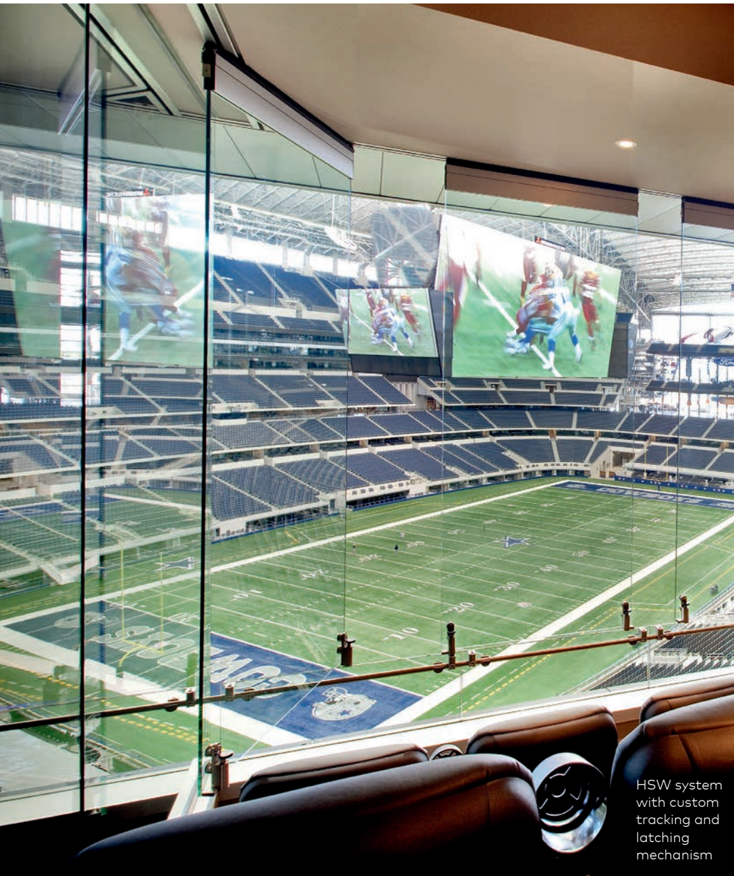
HSW system with custom tracking and latching mechanism

The track can be arranged in a variety of configurations, and sliding panels can be moved without using floor guides or channels. Bolts and locks secure each sliding panel in position and the panels are easy to adjust, align, and operate.