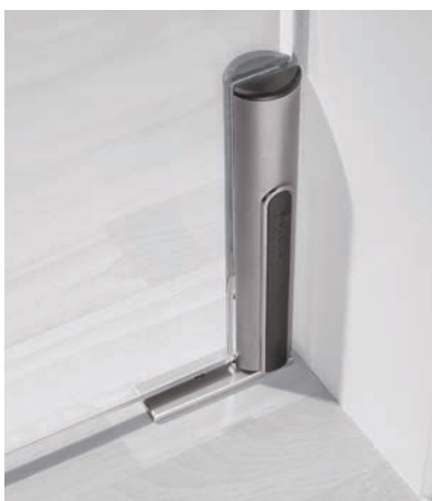
BEYOND swing door system

The unique BEYOND swing door system for glass doors is safe, functional, and attractive. Characterized by its clear styling lines, BEYOND enables you to build frameless swing glass doors into tempered glass assemblies and wall openings.